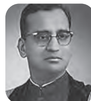
V. K. R. V. Rao