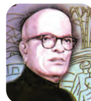
D. R. Gadgil

According to NIC “A national estimate measures the volume of commodities and services turned out during a given period counted without duplication.”